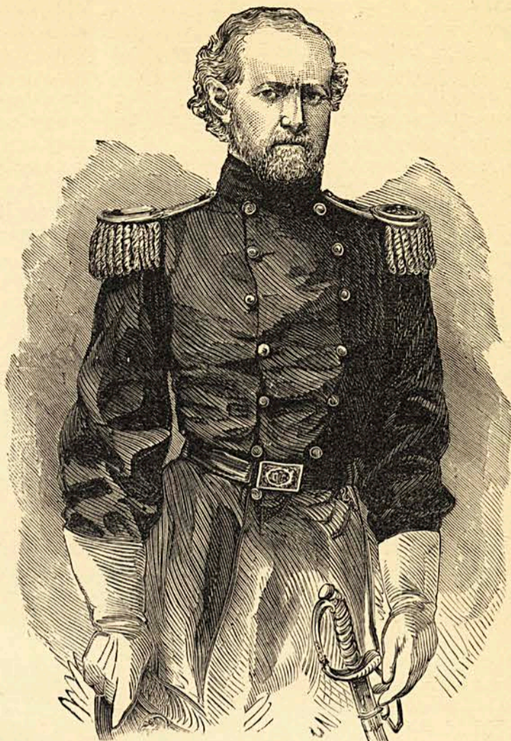
DON CARLOS BUELL.

As the National army came into position before the intrenchments of Spottsylvania, Hancock's corps had the extreme right, or western end of the line; then came Warren's, then Sedgwick's, and on the extreme left Burnside's. While Sedgwick's men were placing their batteries, they were annoyed by sharpshooters. The men naturally shrank back from their work, when Sedgwick expostulated with them, remarking that "they couldn't hit an elephant at this distance." As he stepped forward to the works a bullet struck him in the face and he fell dead. In his fall the army