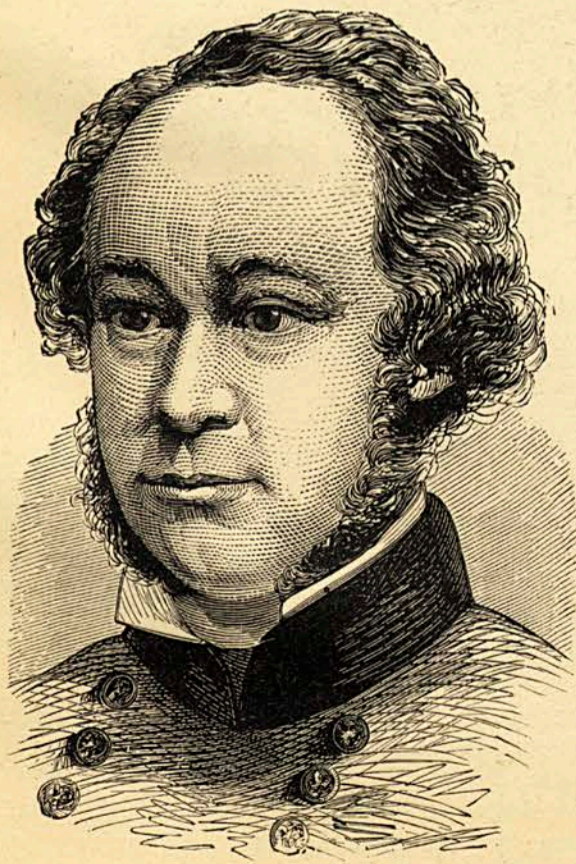
HENRY WAGER HALLECK.

The intention was to have the simultaneous movement of all the armies begin as near the 1st of May as possible. It actually began at midnight