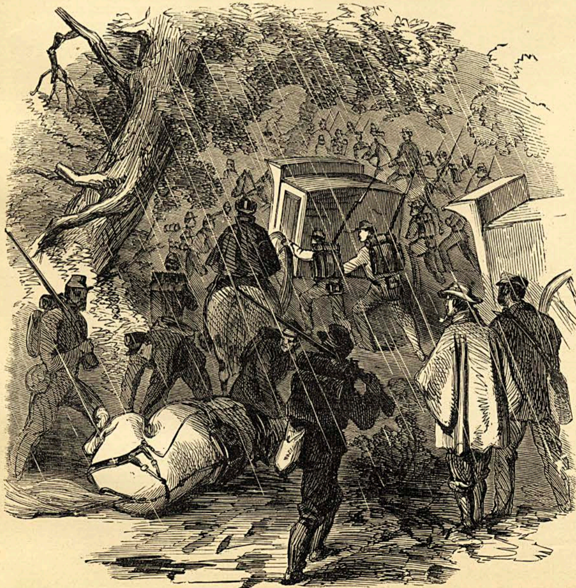
INCIDENT IN THE MARCH OF GENERAL BANKS' DIVISION IN WESTERN MARYLAND.